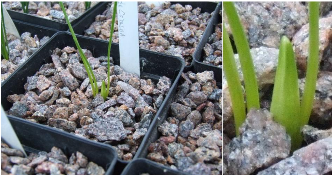
Narcissus serotinus flower bud

Looking around some of the other pots these Crocus mathewii seedlings are growing nicely but they will need little additional watering during these cold weather conditions.