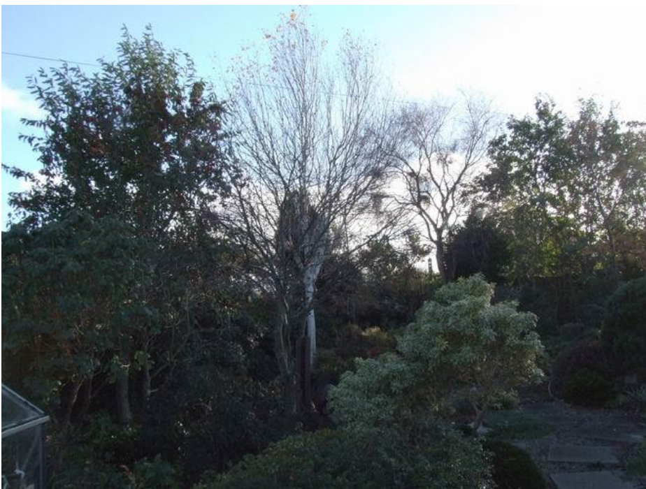
Trees without leaves

Having enjoyed a beautiful mild and bright period of weather, including a high of 18C a week or so ago, now the season is catching up on itself. A very wild night hit Scotland - the much reduced tail end of hurricane Noel brought very strong winds and snow to us here in the North East.