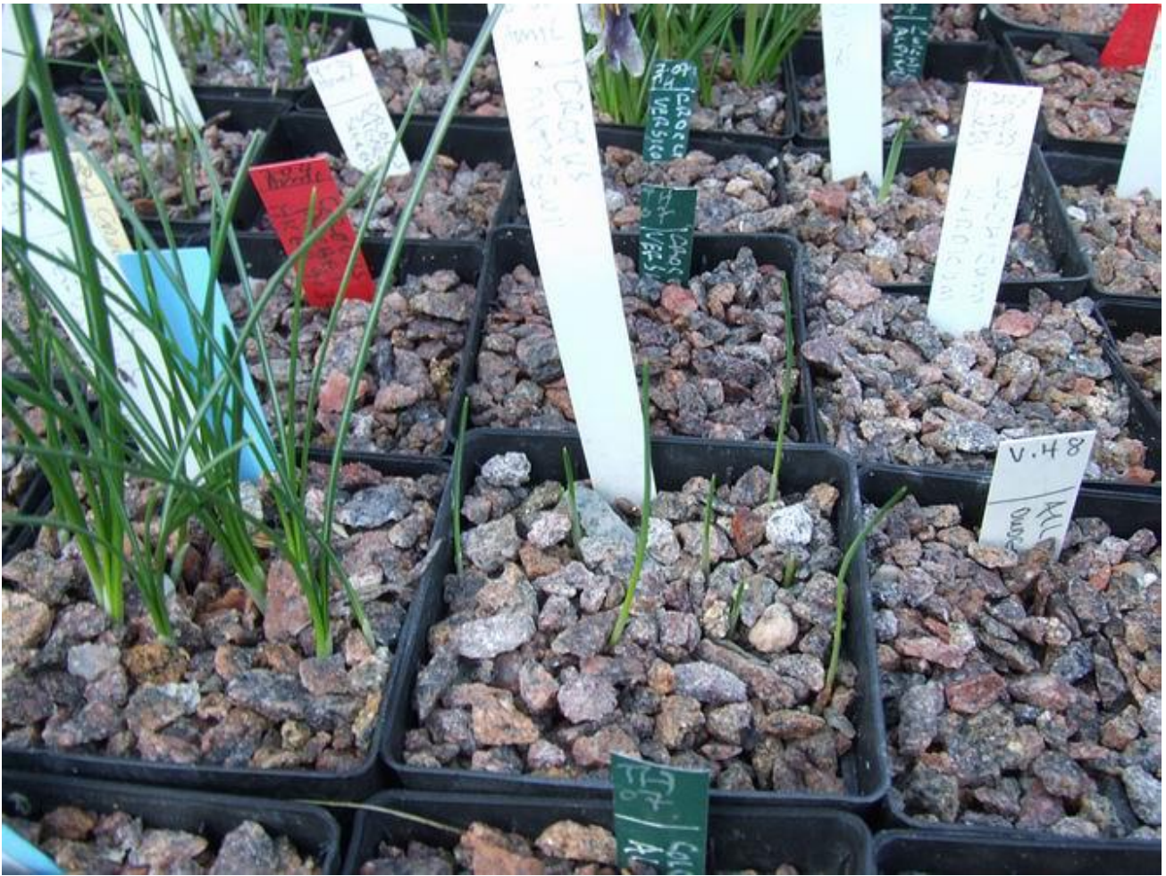
Crocus mathewii seedlings

Looking around some of the other pots these Crocus mathewii seedlings are growing nicely but they will need little additional watering during these cold weather conditions.