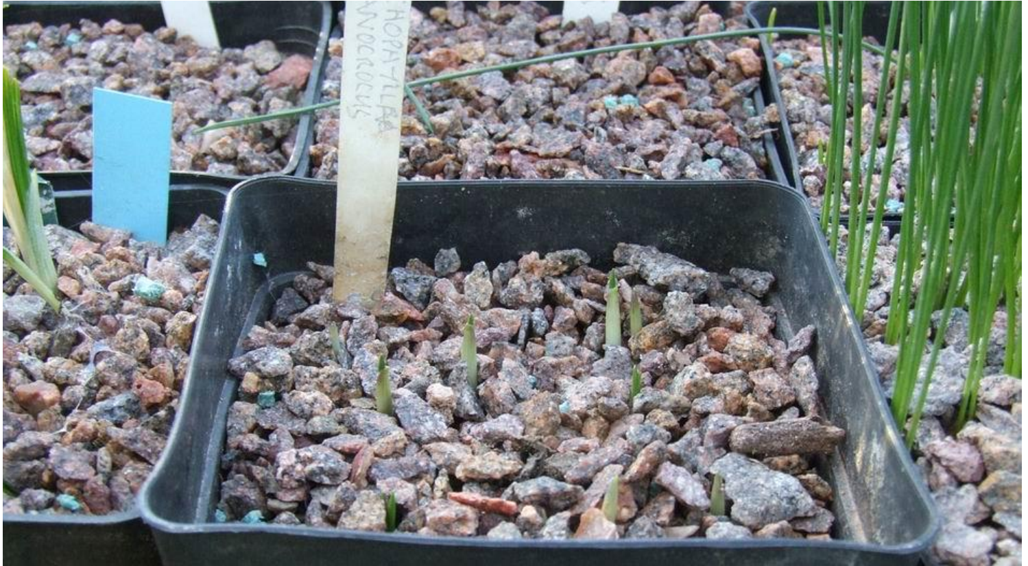
Tecophilaea cyanocrocus shoots

Also just appearing through the gravel are the shoots of Tecophilaea cyanocrocus . It will be March or April before they flower and I always like the shoots appearance to sticking your big toe into the water to see if it is warm enough to tempt you to take the plunge. Obviously, it is not to their liking just now so they will just wait until the average temperature is higher.