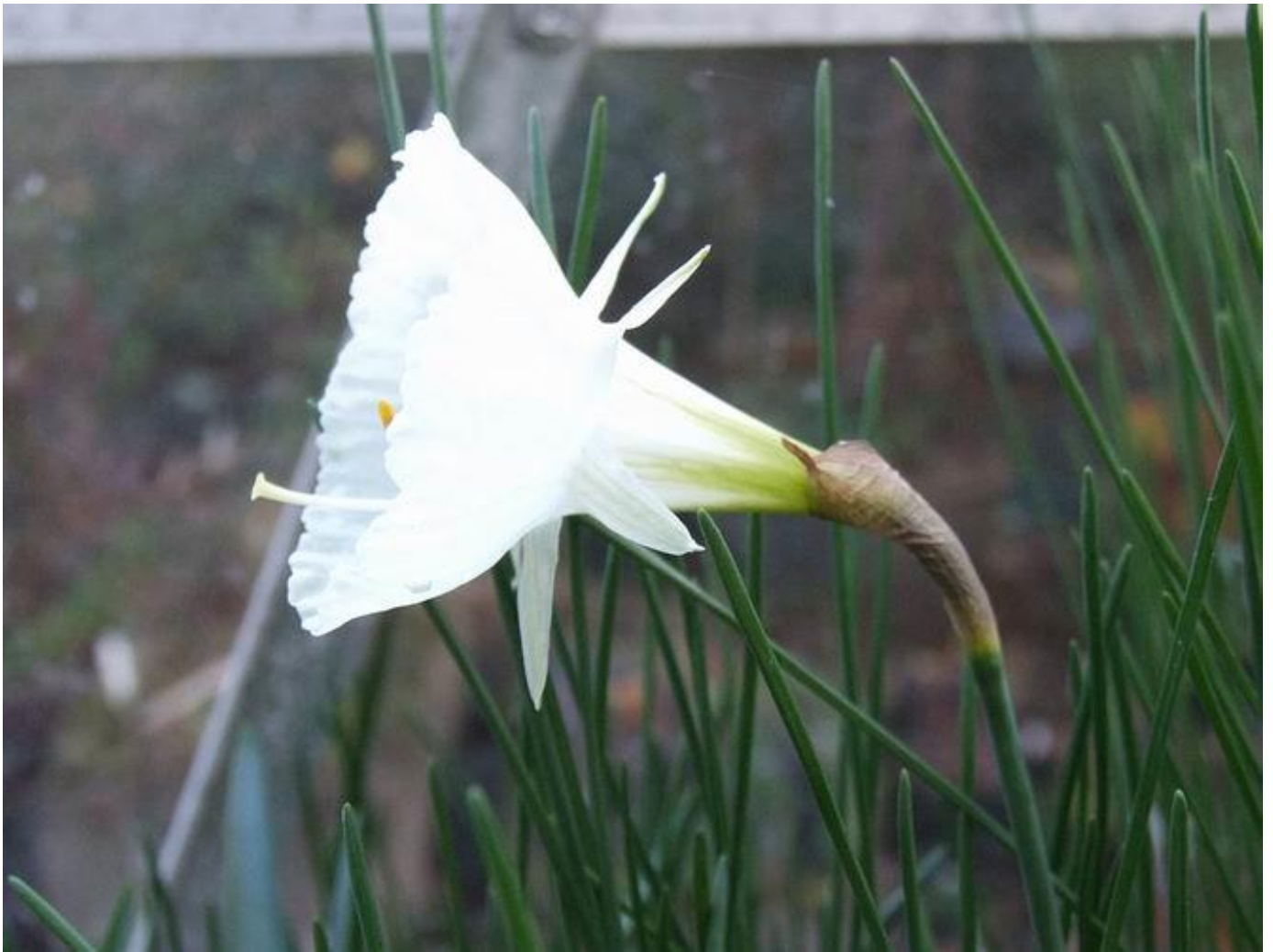
Narcissus 'Camoro' seedling flower side view

This is a shorter edition of the bulb log this week as I am off on a mini talking tour to Ayr and Dumfries so I will end with two pictures of my favourite seedling from N. 'Camoro' to date.