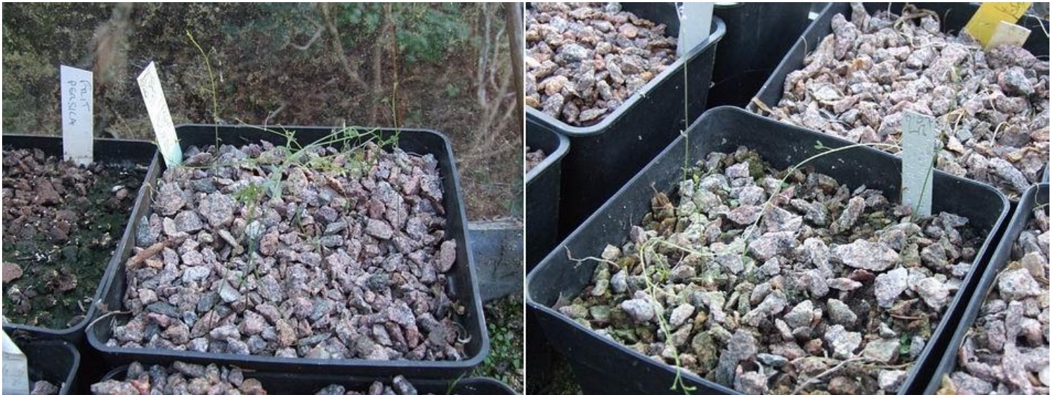
Tropaeolum azureum seedlings

Also just appearing through the gravel are the shoots of Tecophilaea cyanocrocus . It will be March or April before they flower and I always like the shoots appearance to sticking your big toe into the water to see if it is warm enough to tempt you to take the plunge. Obviously, it is not to their liking just now so they will just wait until the average temperature is higher.