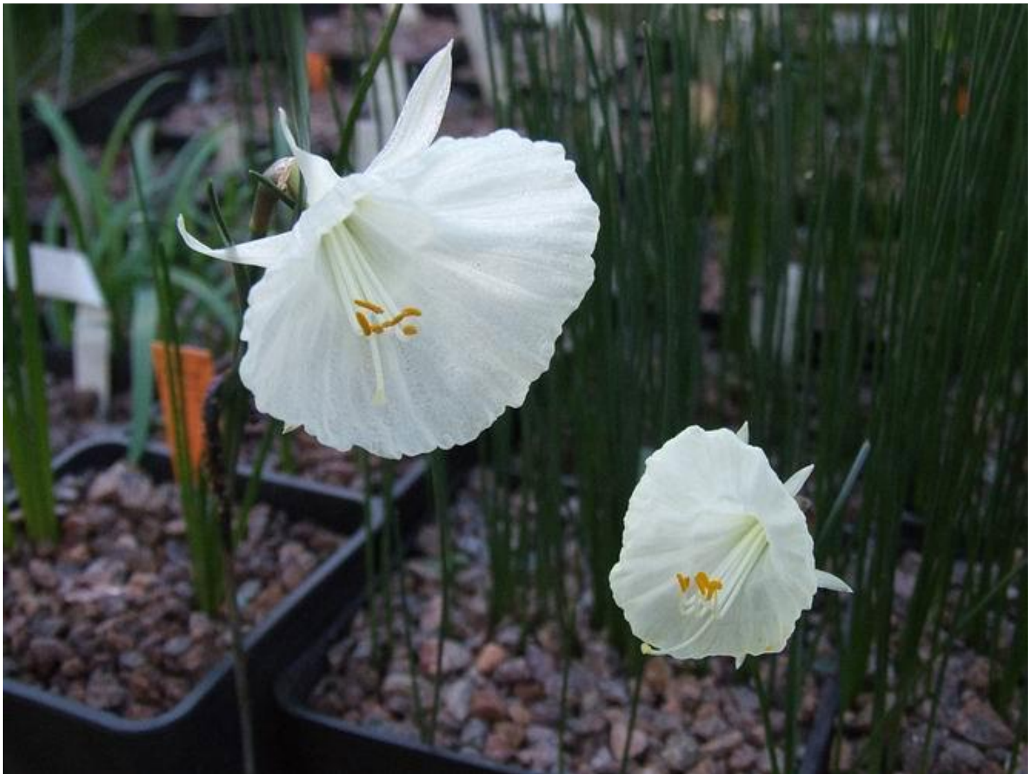
Narcissus seedling flowers