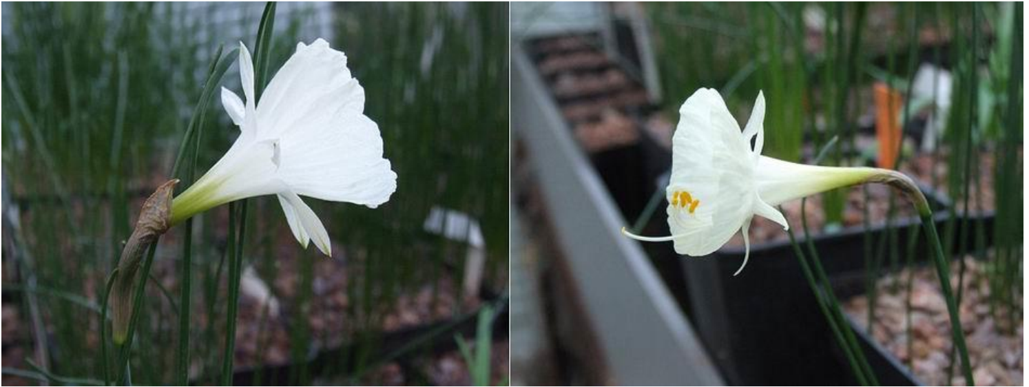
Two Narcissus seedlings

Seen in profile you can see there are more differences between the two flowers than there appears at the first glance. I much prefer the elegant lines and pure white of the 'Camoro' seedling.