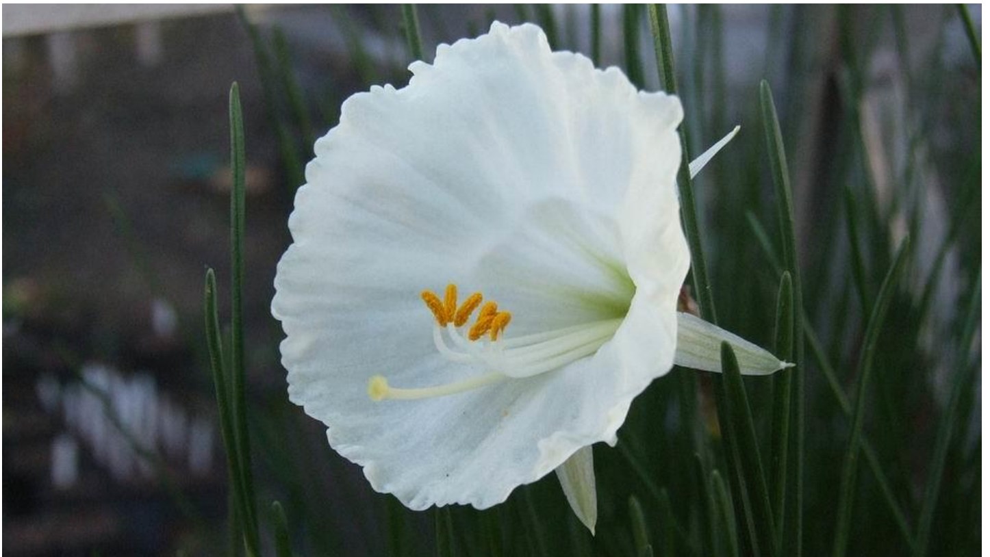
Narcissus 'Camoro' seedling flower

This is a shorter edition of the bulb log this week as I am off on a mini talking tour to Ayr and Dumfries so I will end with two pictures of my favourite seedling from N. 'Camoro' to date.